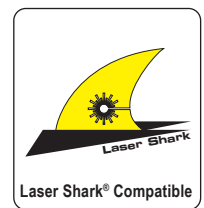
The KX4 hard buttons (5) may be custom laser etched using the RTI Laser Shark service.