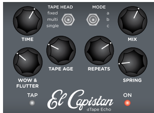
IN THE CANYON