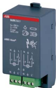
ABB i-bus® KNX Switch Actuator Module, 2-fold, 6 AX SA/M 2.6.1, 2CDG 110 002 R0011